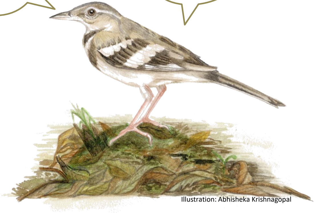
Illustration: Abhisheka Krishnagopal